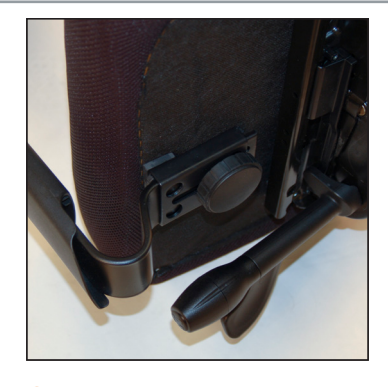
2. Remove the armrests from the chair (reference Arm Replacement guide) mechanism, and set aside for later reinstallation.