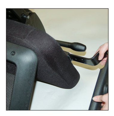
10. Reattach armrests, and set the seat/back assembly on the floor, reinsert cylinder, and then slip base onto the cylinder.