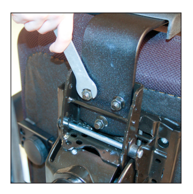
9. Reattach backrest with the 3 bolts and nuts, and then, replace the black, plastic cover.