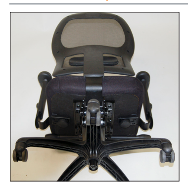
First, tip the chair forward/ over until the base is off the floor. This allows access for base removal.