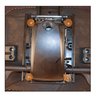
6. Locate the 4 Phillipshead screws securing seat to mechanism.

Note: 2 screws may be obscured by the seat slider. Before releasing and moving slider to reveal them, keep hands and fingers away from the slider. The slider control is the "wing" on the left-side mechanism control.