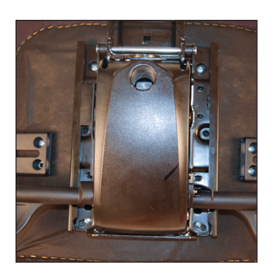
8. Position new mechanism on the seat in same manner as the old one, and center the holes for the screws over the same T-nut receptacles.