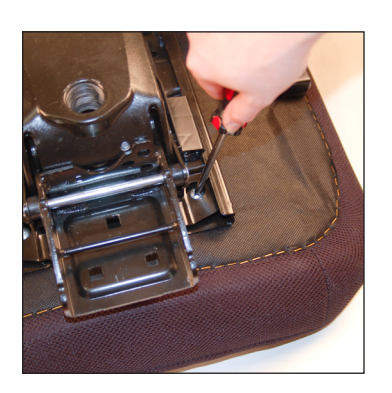
7. With all 4 Phillips screws revealed and removed the mechanism can now be lifted off the seat.