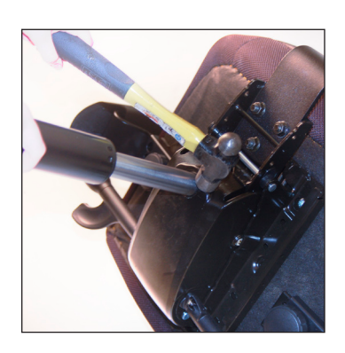
4. Remove cylinder from mechanism: Hold the end of the cylinder with one hand, and hammer the mechanism around the cylinder entry point. Several strong blows may be required to dislodge the cylinder from mechanism.