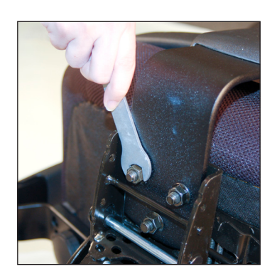
5. To remove backrest, first remove the black, plastic cover where back post meets mechanism. Next, locate and remove the 3 (%6") nuts that secure backrest post there. Slip the bolts up and out and set aside for later reinstallation.