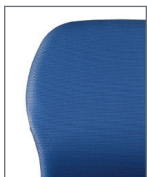
S1 or S2 Grade C or 1 (S1) Grade 2 (S2) 1 back only