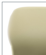
S5 UltraLeather™ 1 back only