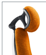
H4 Dual Pivot 8 back only