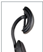
HE Height Adjustable 1 back only