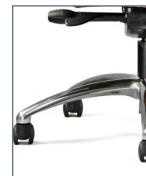
B6 26" Polished Aluminum