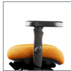
3 Arm 360° Swivel w/ Oversized Urethane