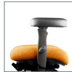
6 Arm Oversized Black Vinyl Arm Pads