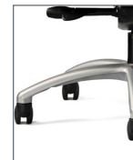
B8 27" Brushed Aluminum