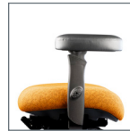
7 Arm Oversized Fabric/ Leather Arm Pads