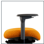
0 Arm 5-way 360°