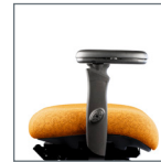
P Arm 360° Swivel