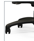
B12 28" Black