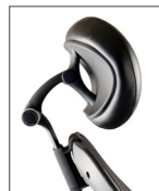
H5 Dual Pivot 1 back only