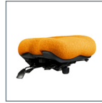
6 Seat Medium Seat, Moderate Contour