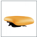
3 Seat Medium Seat