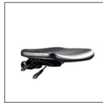
5 Seat Urethane Seat