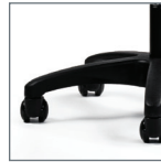
B22 22" black