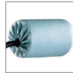
2 AbRest™ Upholstered