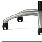
B8 27" Brushed Aluminum